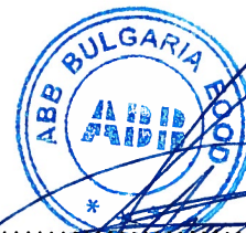
ABB Bulgaria EOOD

Main office: 9, Christophor Columbus Blv., fl.3 1592 Sofia, Bulgaria Tel.: (+359 2)8075500, 8075600, 8075700 Fax: (+359 2)8075599 (8,7,6) Web: www.abb.bg e-mail: office@bg.abb.com