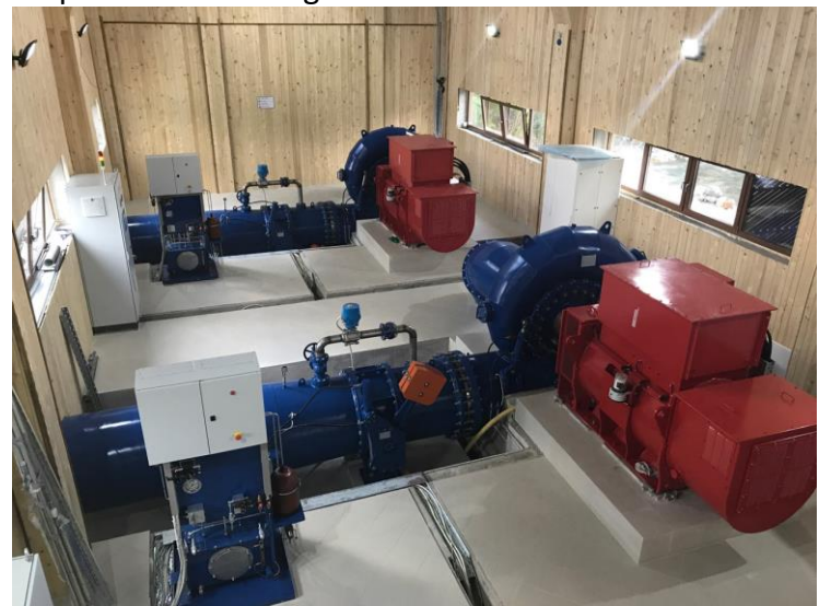
Hydropower plant developed with Vaptech technology and systems